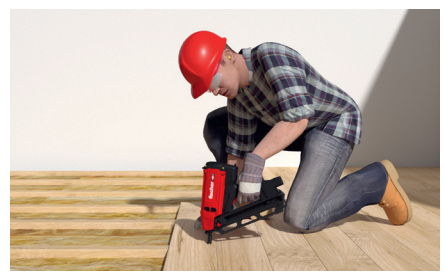
For fixings of boards on floors