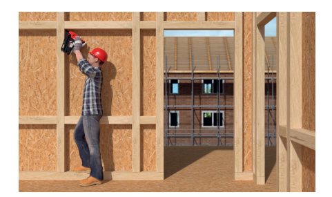
The FGW 90F has a perfect balance for overhead applications