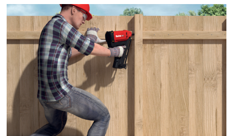
Easy infinitely nail depth adjustment for various applications