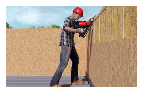
The FGW 90F is suitable for panelling of OSB boards