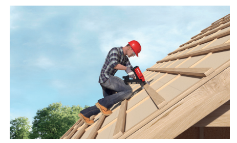
The ability of fixings in fast frequency enables to get the work done quickly