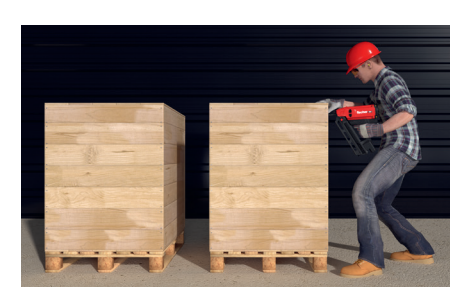
The FGW 90F is suitable for various applications