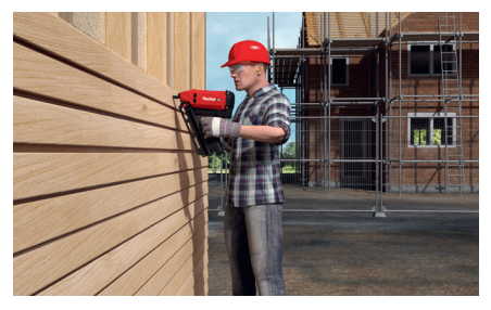
Protective cap to protect the timber surface in visible areas e.g. external cladding