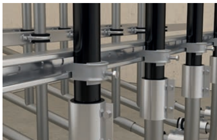
Supply lines fixed to FUS channel