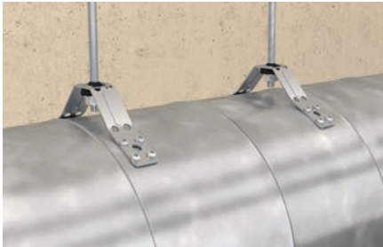
Spiral duct pipe with sound insulated hanger