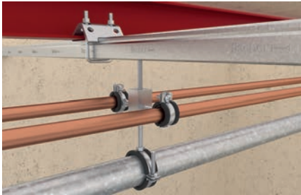
Fixation with multi-connector