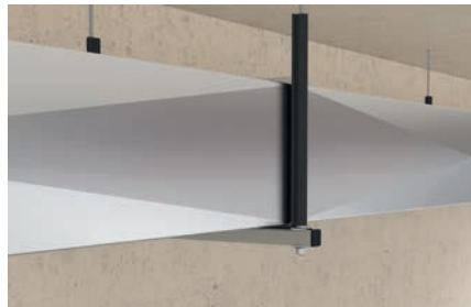
Air duct fixing with channel