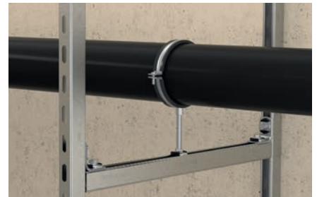
Pipe fixing on frame construction