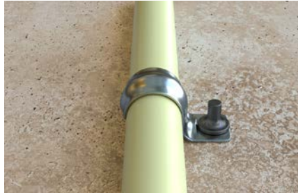
Fixing armoured conduits