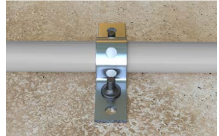
Fixing perforated tapes